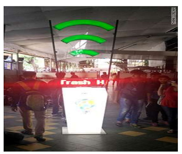
Figure 1.1: Wifi trash bin

People that throw trash into the trash bin will receive a unique code, which can then be used on devices to be able to gain access to a free Wi-Fi connection. They then realized that for a cleaner environment, what was needed was not just a change in structure but also an adjustment on the attitudes of people.